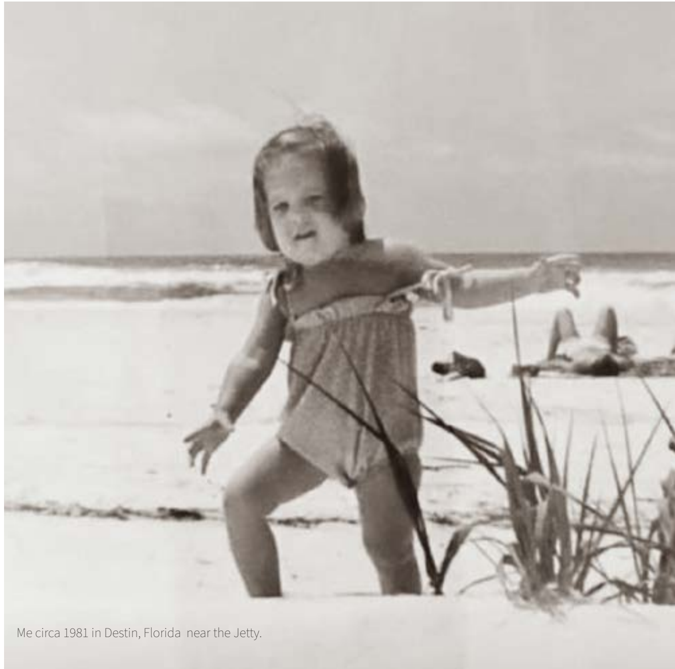
Me circa 1981 in Destin, Florida near the Jetty.