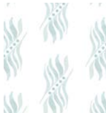
Palms at play