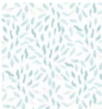
Coral on parade