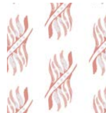
Palms at play