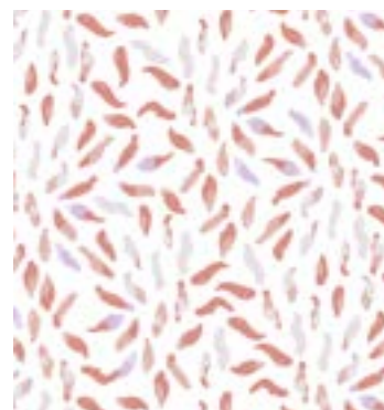
Coral on parade